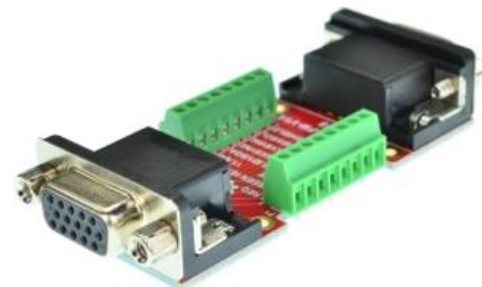
Figure 4: D15HD-F-F-V1A with terminal blocks

Caution!! When assembling the D15HD-F-F-V1A, please make sure you place the connector on the right side.