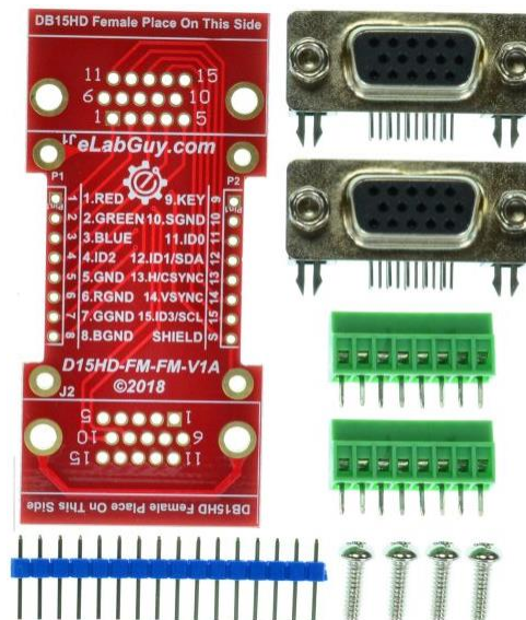
Figure 1: Parts inside the kit (Note: the module is not assembled, user can decide which connector to use on the module.)