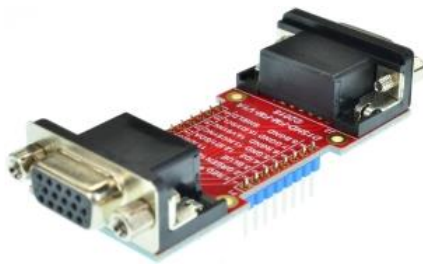
Figure 3: D15HD-F-F-V1A with headers